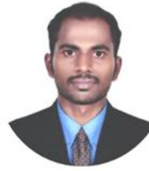
Junior Software Engineer