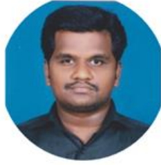
Senior Software Engineer