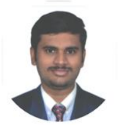
Senior Software Engineer